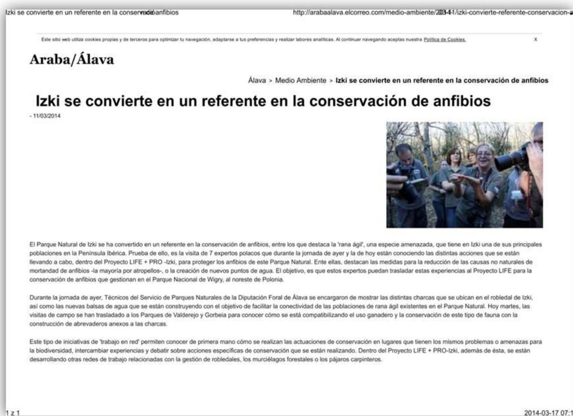
Photo 1. Mention in the local press about the visit of specialists from Poland.

During the reporting period several meetings with representatives of other LIFE projects took place. Between March 8th and 15th, 2014, the first, out of five scheduled foreign visits, took place. Group of four people participated in the trip to Spain, visiting the sites of two LIFE-financed projects funded by the EU. Contacts with the project "PRO-Izki - Ecosystem Management of Iznik Quercus pyrenaika forest and habitats and species of community interest related to it." established in the IZKI Landscape Park in the Basque Country. In Catalonia, the project "PROYECTO ESTANY - Improvement of the Natura 2000 habitats and species found in Banyoles: a demonstration project" was introduced. The trip was an opportunity to exchange experiences and establish closer contacts between specialists, as noted in the local press (Photo 1). The report of the trip is Annex No. 7 to the Report.